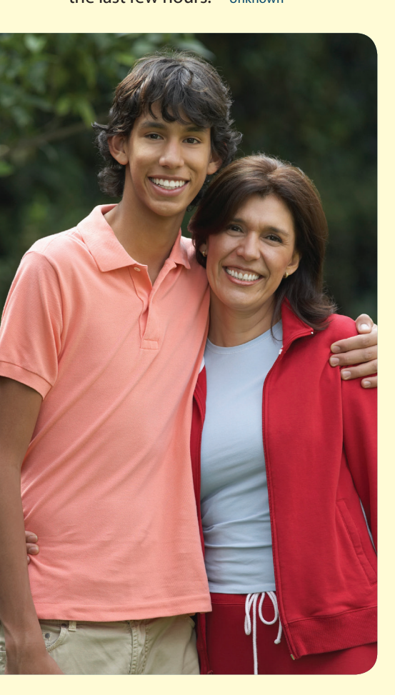
For more material on the home and family, fathers and mothers, husbands and wives, grandparents, and family finances, go to www.housetohouse.com.

By contrast, ten of the best adjusted teens answered the question by saying, "This morning" or "Last night" or by indicating that they had been verbally reassured of their parents' love within the last few hours. —Unknown